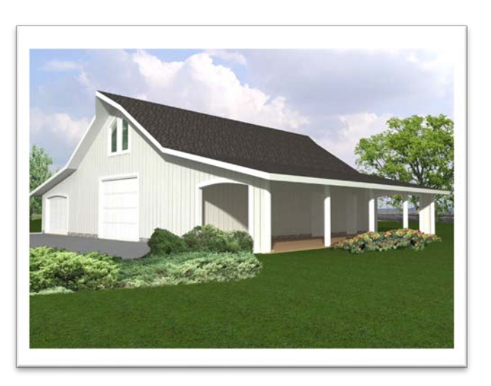
Color scheme pending