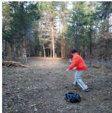
Hole 5 - Fairway Shot