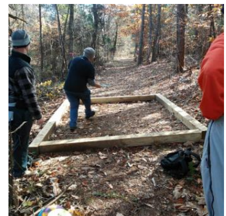
Hole 9 - Tee Shot