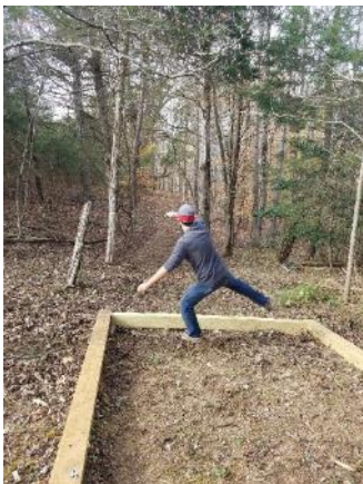
Hole 2 - Tee Shot