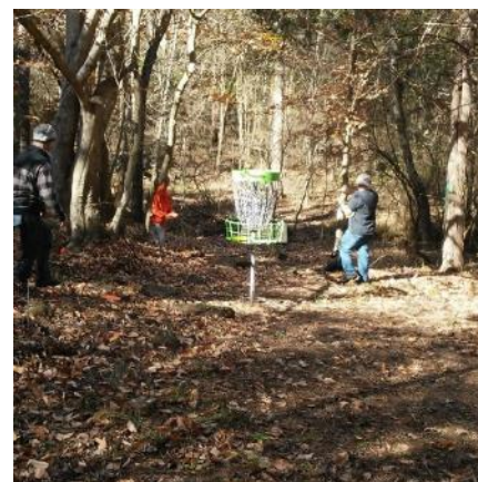
Hole 6 - Putter Shot