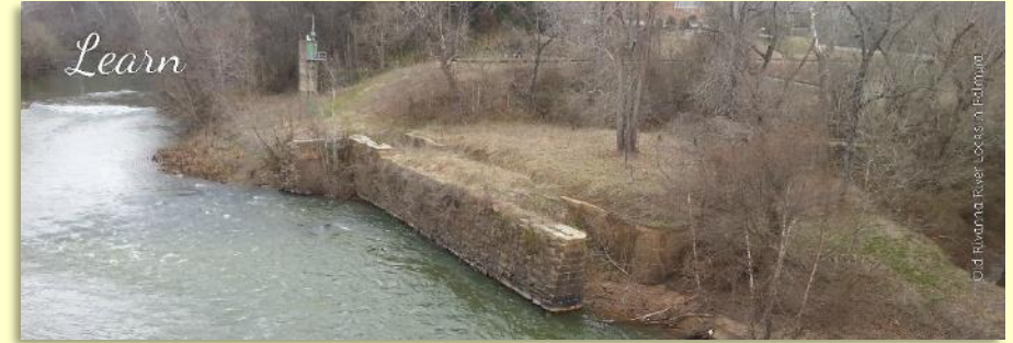
Old Rivanna River Locks in Henricum