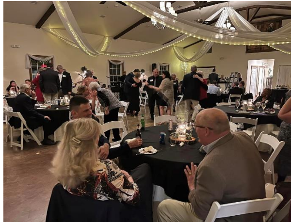
Fluvanna-Louisa Housing Foundation Supporters enjoying the party.