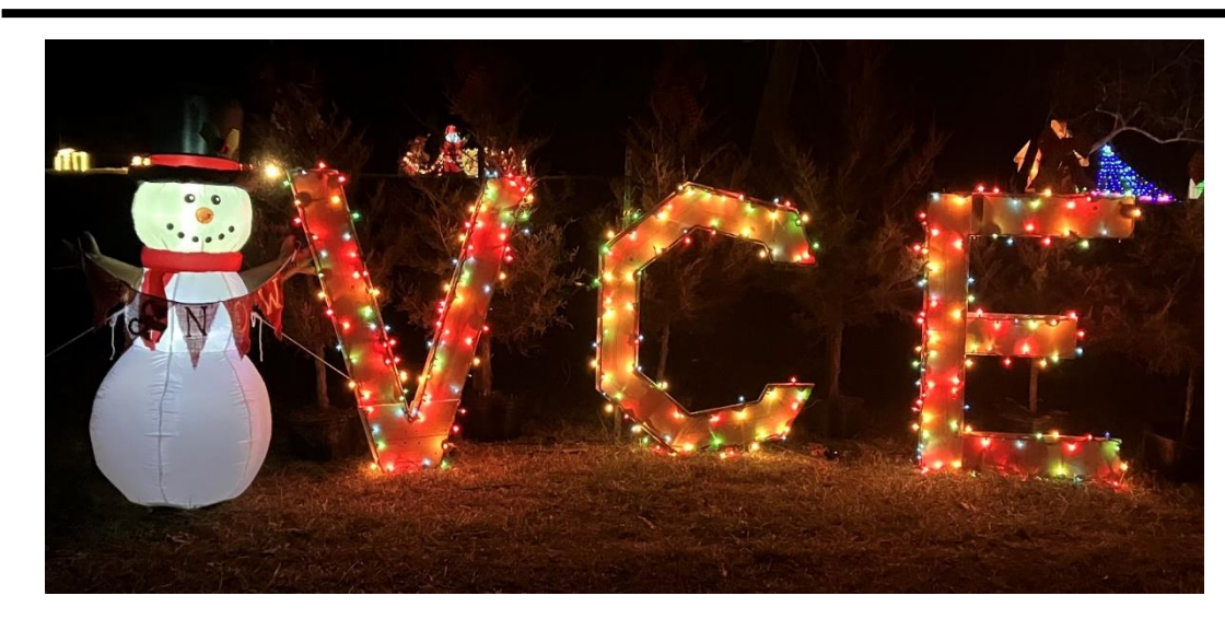
FLUVANNA EXTENSION OFFICE