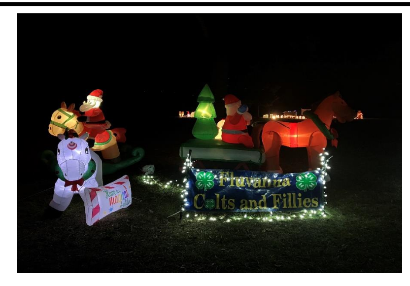
FLUVANNA 4-H CLUB