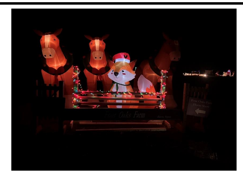
FOUR OAKS FARM