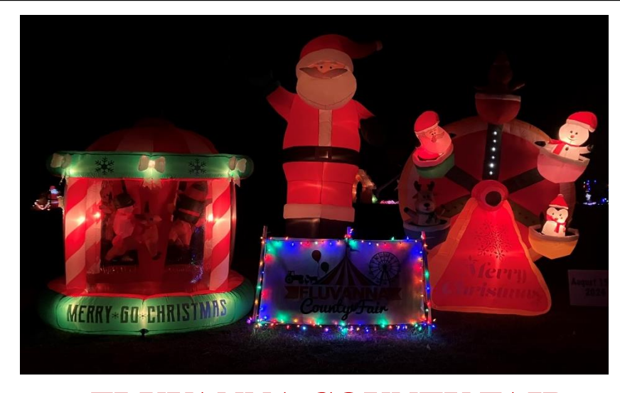
FLUVANNA COUNTY FAIR