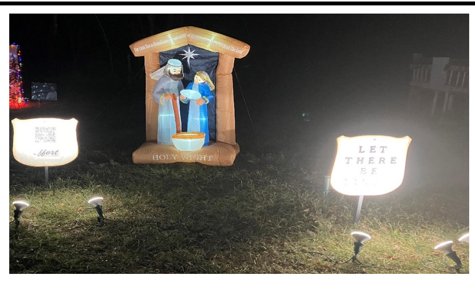
EFFORT BAPTIST CHURCH