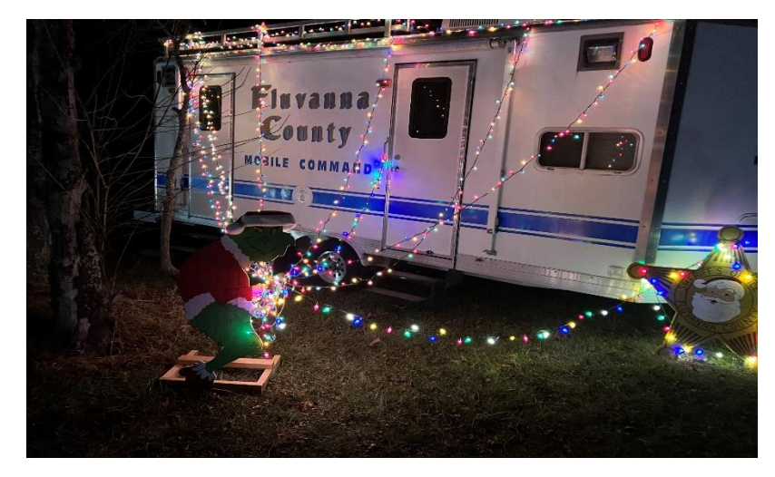
FLUVANNA SHERIFFS DEPARTMENT