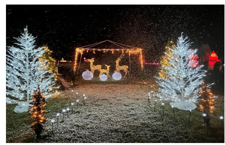
THE ELEPHANTZ TRUNK