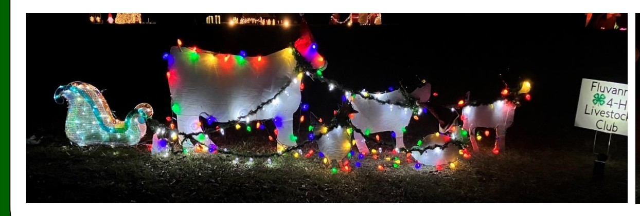
FLUVANNA 4-H LIVESTOCK CLUB