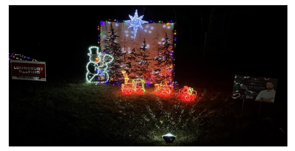
LOUNSBURY ROOFING & TOWN REALITY