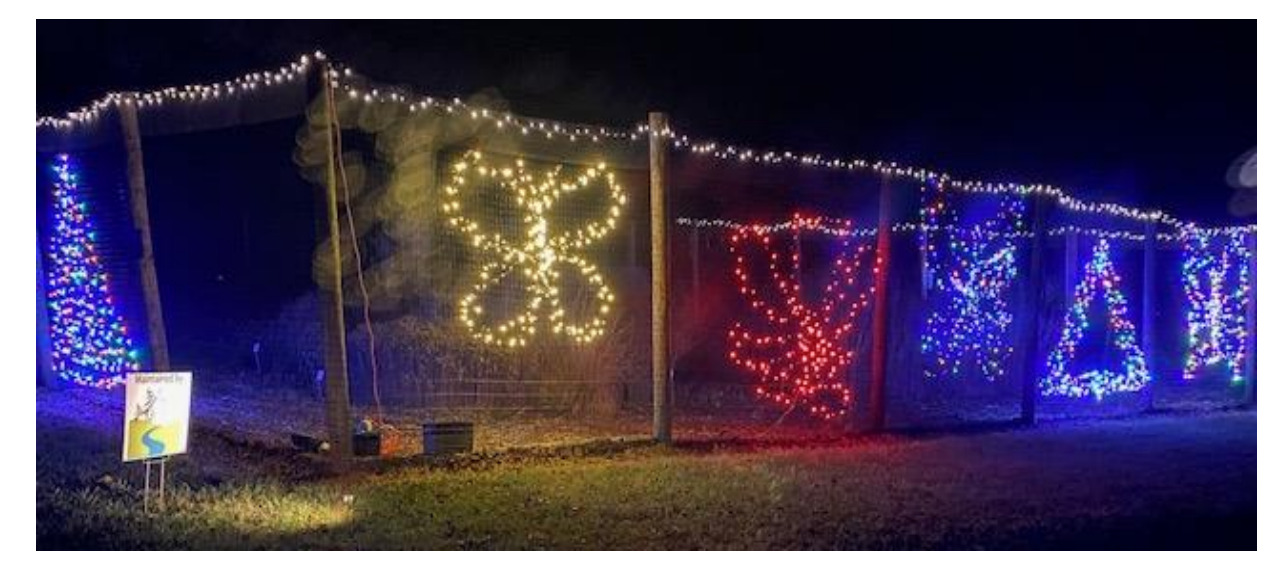
FLUVANNA MASTER NATRUALIST