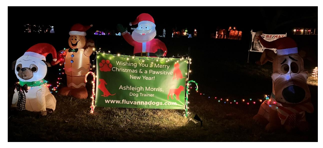
ASHLEIGH MORRIS; DOG TRAINER