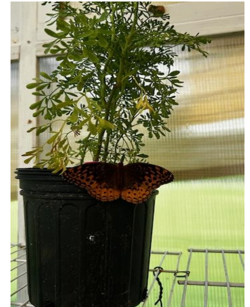
Figure 3: Two butterflies on a plant in the Fluvanna Master Gardener Discovery Center