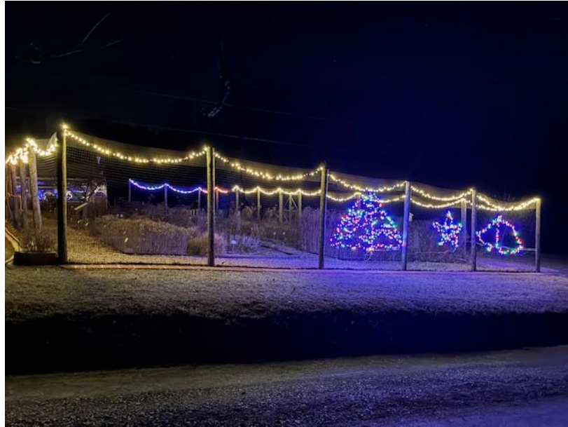
BUTTERFLY GARDEN MASTER GARDENERS