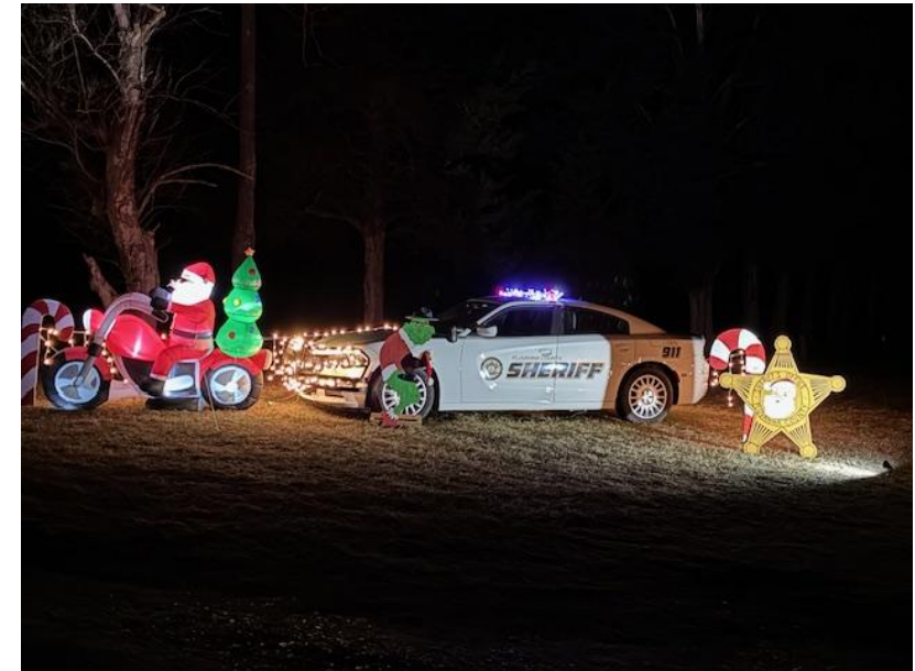
FLUVANNA COUNTY SHERIFF'S DEPARTMENT