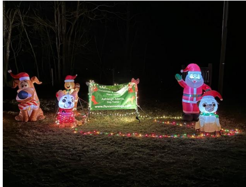
ASHLEIGH MORRIS DOG TRAINING