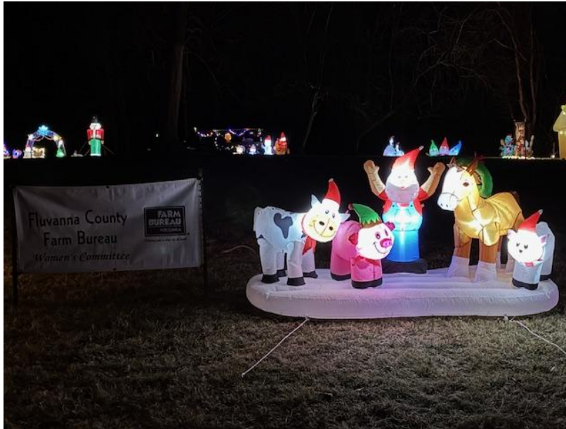
FLUVANNA FARM BUREAU WOMEN'S COMMITTEE