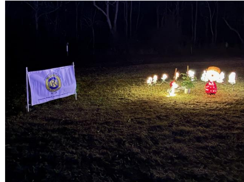
FLUVANNA RURITAIN CLUB