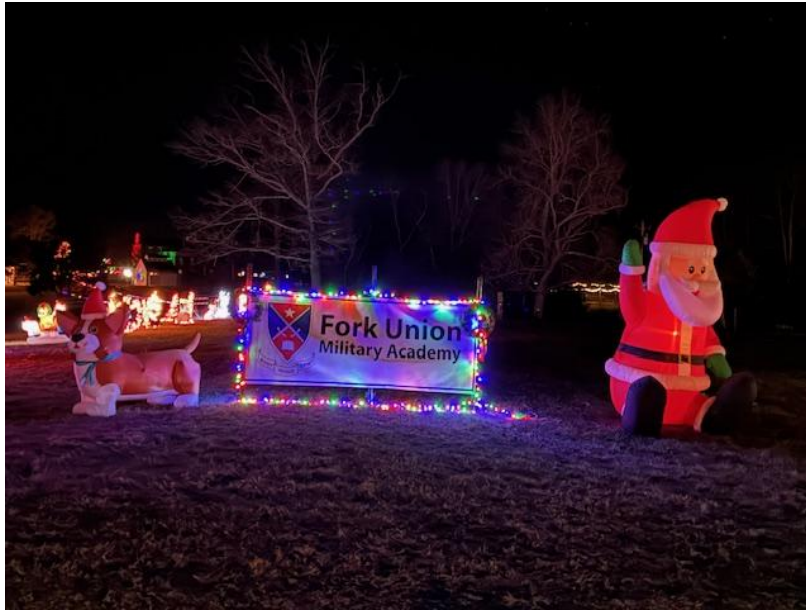
FORK UNION MILITARY ACADEMY