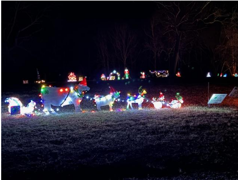
LIVESTOCK 4-H CLUB