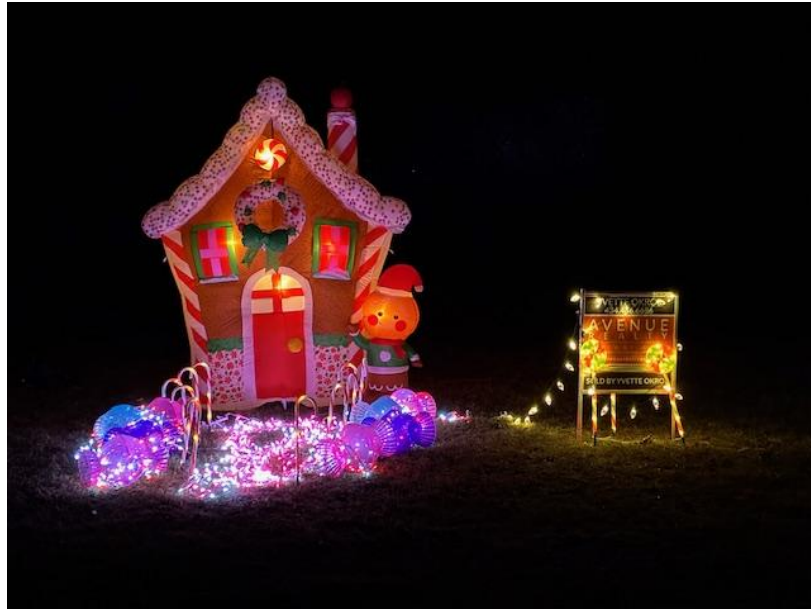
YVETTE OKROS AVENUE REALITY