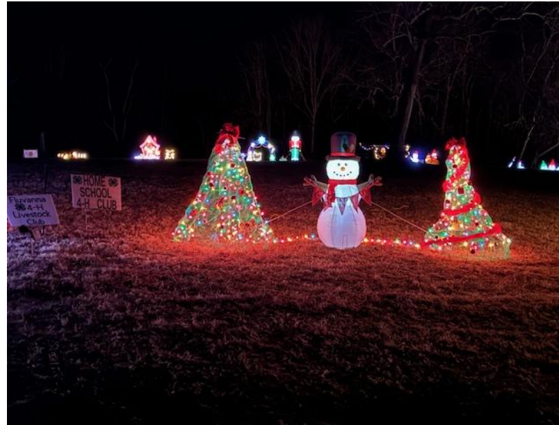
HOMESCHOOL 4-H CLUB