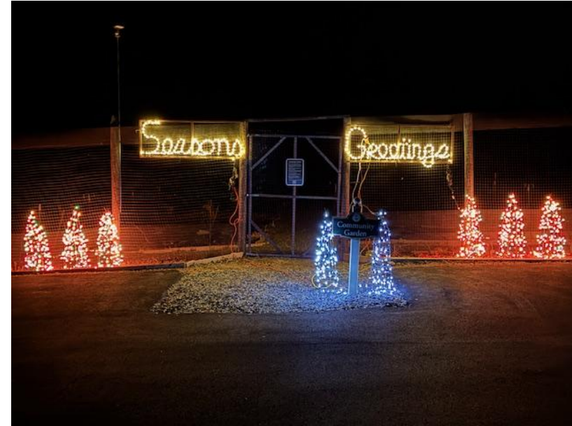
COMMUNITY GARDEN MEMBERS