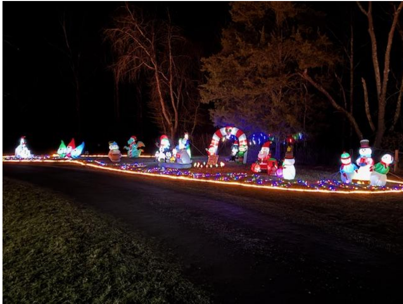
FLUVANNA COUNTY LIBRARY