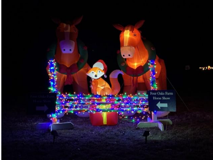
FOUR OAKS FARM