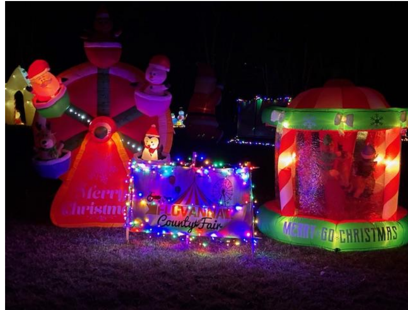
FLUVANNA COUNTY FAIR BOARD