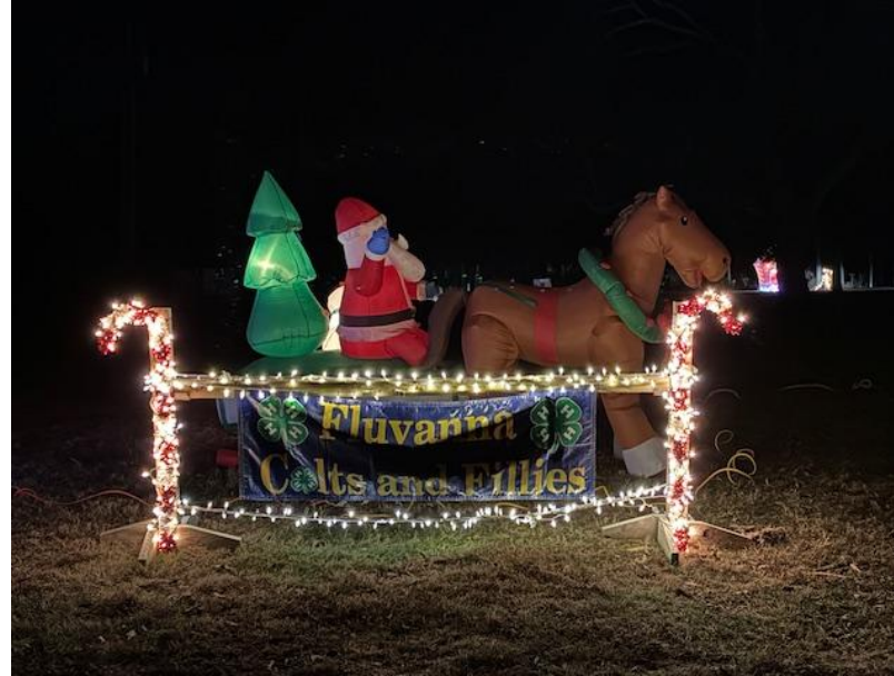
COLTS AND PHILLIES 4-H CLUB