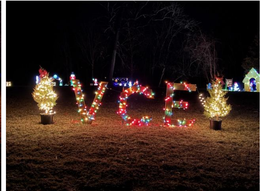
VIRGINIA COOPERATIVE EXTENSION - FLUVANNA