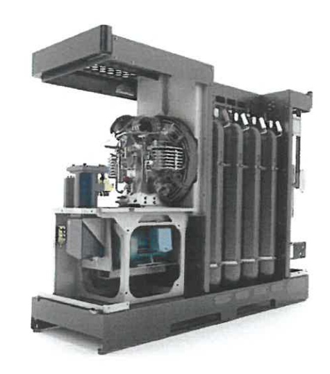
> UNICUS 4i (SHOWING INSIDE BACK)