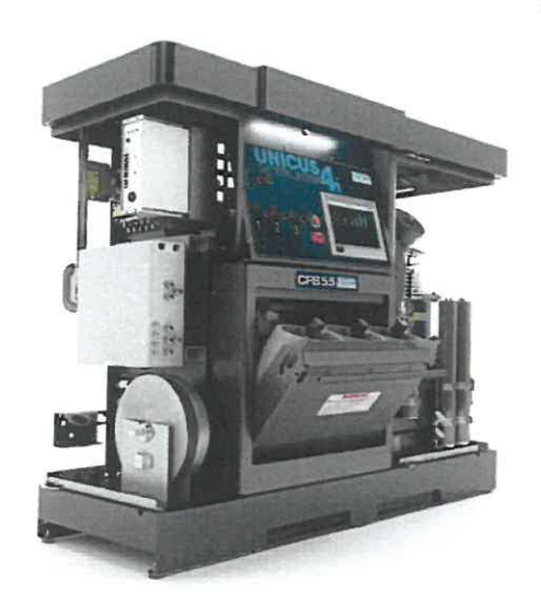
> UNICUS 4i (SHOWING INSIDE FRONT)