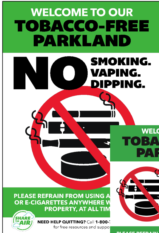
Aluminum Signs 12" x 18"