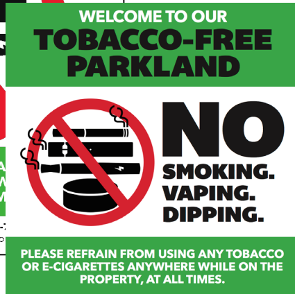
Decals 8" x 8"