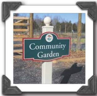
Pleasant Grove Park