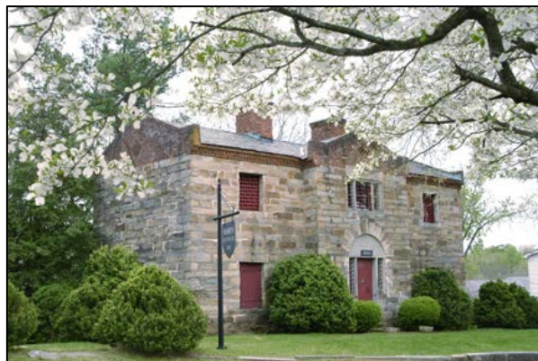
The Old Stone Jail

28. The Village Park on the north end of the village is owned by Fluvanna Historical Society. The National Historic Register District continues a few yards north of this park. The southern end of the Historic District runs to the Rivanna River.