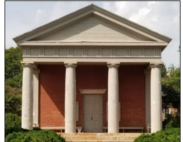
The Acropolis of Palmyra

the construction of the courthouse, including hauling and installing the huge stone steps. It is one of only a few antebellum courthouses to retain its original form without additions or changes to its interior arrangement. The building served as an operating room during the Civil War.