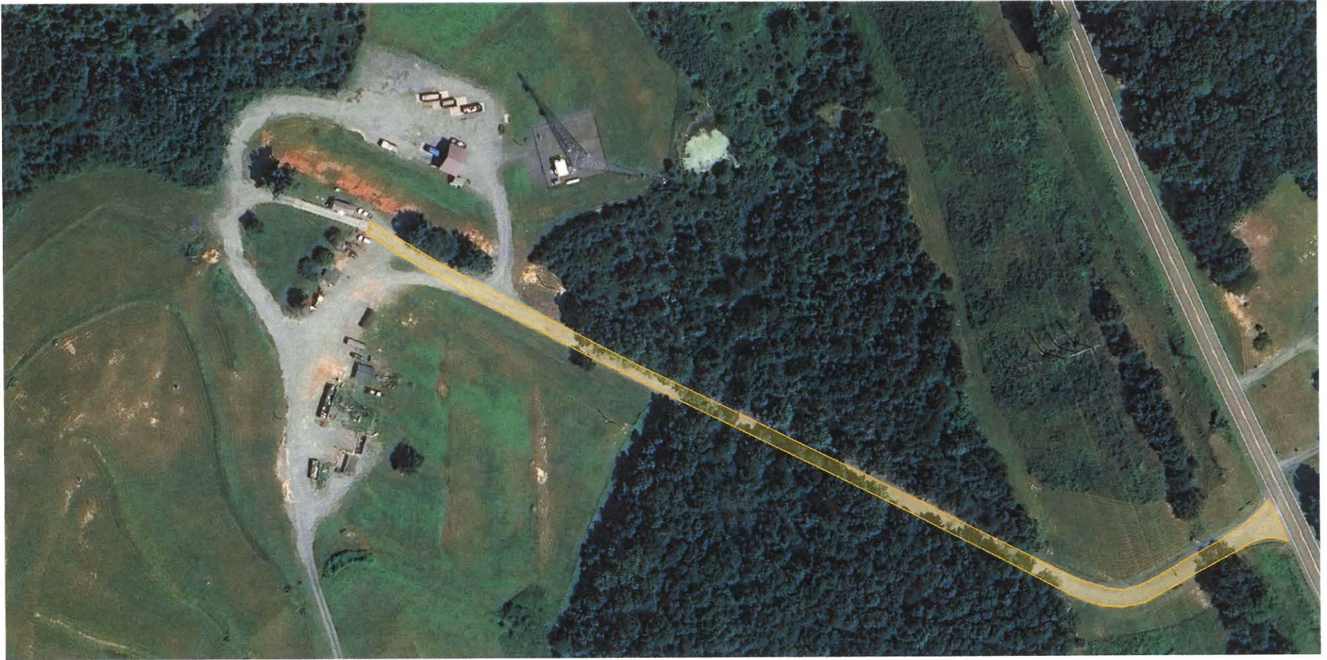
Yellow: Fluvanna County Convenience Center Entrance Road. Area Approximately 2,626 Square Yards, Length of Road Approximately 394 Yards.