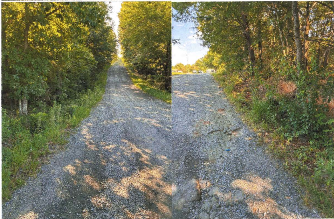
ATTACHMENT #5 Pictures