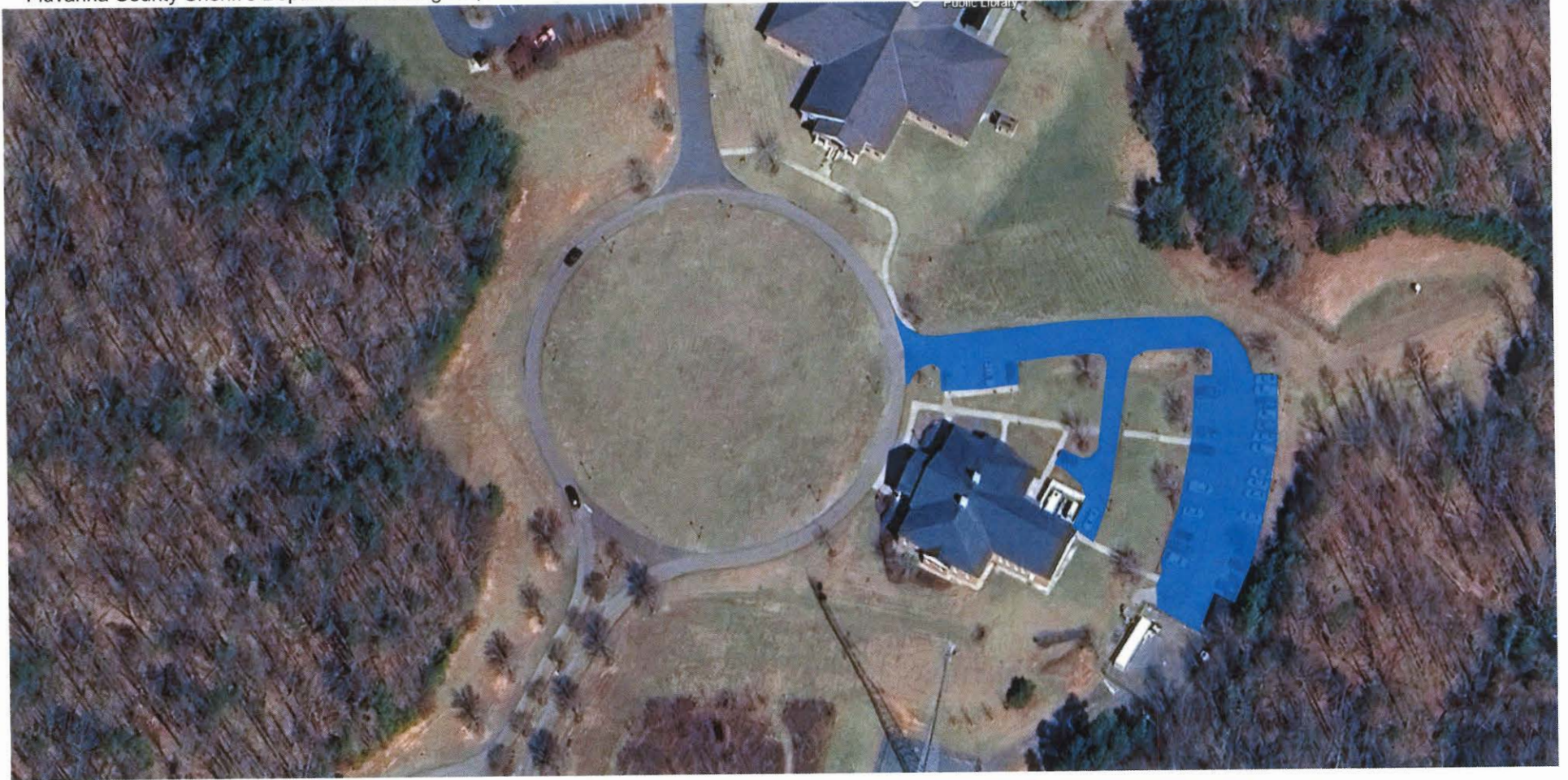
Fluvanna County Sheriff's Department Parking Lot, Attachment #1

Blue: Fluvanna County Sheriff's Department Paving Scope Approximately 2,622 Square Yards